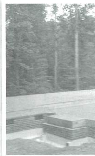
The finished floor trusses covered with floor decking.