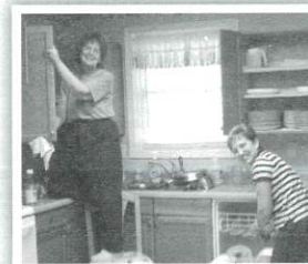
Cleaning a missionary home.