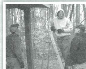
Faith Baptist working on porch ceiling.