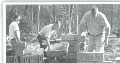
Faith Baptist laying block.