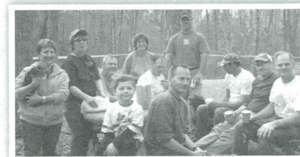
Faith Baptist Church work team.