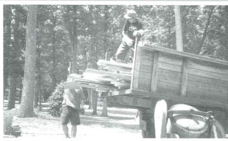
Moving the wood out of the old barn to stack in the new workshop