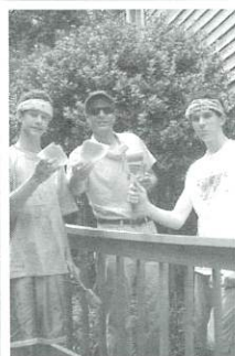
You gotta have break time! Watermelon hits the spot on a hot day.