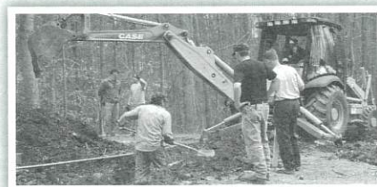
Faith Baptist Church digging footers.

Over the past three weeks we have had groups doing different things. The first group of the summer completely cleaned out the tractor shed in preparation to convert it into the wreck center (our game room). A very, very big job. They moved all of the things from there to the new workshop and put it away. Thank you Freedom Baptist (Goldsboro, NC). The group last week put the entire floor system on the Rice House, as well as water proofed around the foundation; helped to organize a few things around here; painted hand rails, porches and decks; and weeded the property. Thank you to Bible Baptist (New Milford, CT). The third group came from Maple Grove Church (Topeka, IN) to bring boxes full of food for Dad's Country Store and to put decals on the RV. All of this to say that without all of our supporters "prayerfully, financially, physically" this place would not be the oasis that it is today for the missionaries that stay here. Thank you for being sensitive to the Lord. Thank you from myself and the staff here at Siloam. We love and appreciate you! — Mike Rich, Director