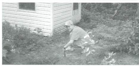
Helping weed the garden.