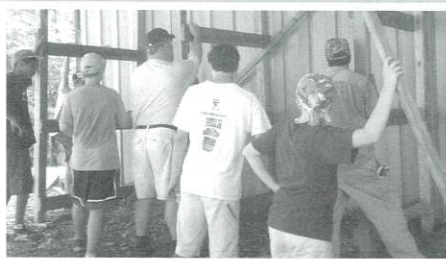
Freedom Youth putting up shelving for lumber