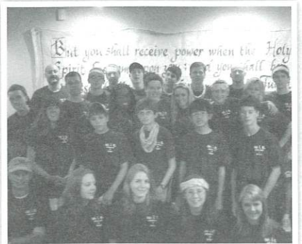
Bible Baptist Youth group photo.