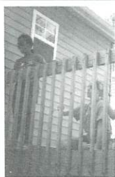
Bible Baptist Youth stained and painted 4 decks on some of our homes.