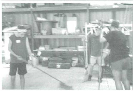
Freedom Baptist Church cleaning up Papa's Workshop