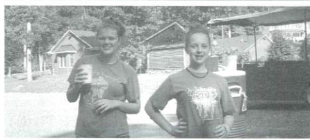
Let's take a break.