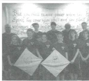
Freedom Baptist Youth group photo.