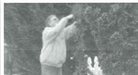
In January a group from Crosslink Community Church came out to help take down and put away Christmas decorations.