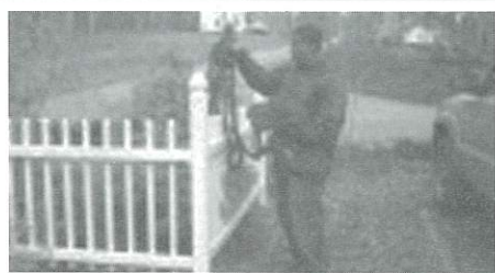
Removing lighted garland from Burden/ Love Chapel fence.