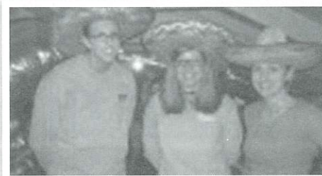
Taking time for fun while organizing the Christmas decoration storage area.