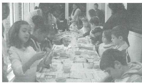
MK's painting Christmas ornaments during their party.