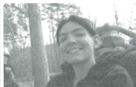
Smiles from a volunteer.