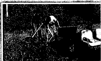
Wake Christian Church weeding and mulching around houses