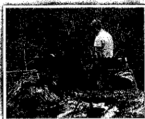
Crosslink Community Church cleaning up brush