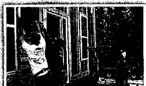
Brush Creek Baptist Church young adults putting on front facade of Wreck Center