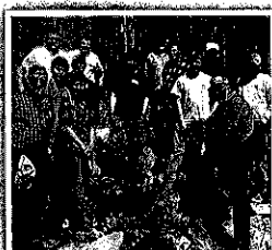
Mebane Presbyterian Church cleaning up brush