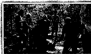
Wake Christian Church pouring footers for back steps of missionary house