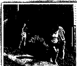
Cornerstone Baptist Church weeding & mulching around missionary houses