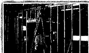
Wake Christian Church building interior wall for Wreck Center