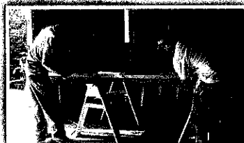
Brush Creek Baptist Church building an interior wall on Wreck Center