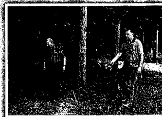
Missionary Men's Fellowship - playing horseshoes