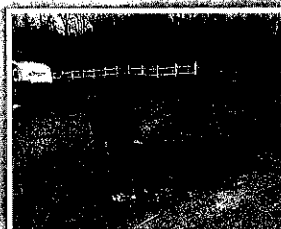
Summerfield Baptist Church mulching at the entrance way