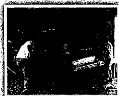
Cornerstone Baptist Church pouring the cement floor for Wreck Center