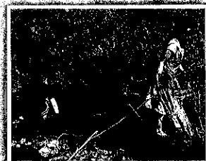
Missionary kids playing in the creek