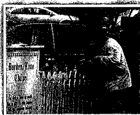
Crosslink Community Church pressure washing the Chapel