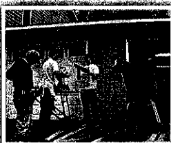
Summerfield Baptist Church installing a door on the Treasure Chest