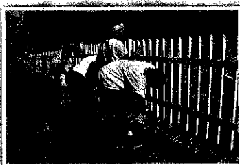
New Covenant Fellowship painting the fence at the entrance