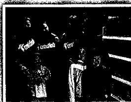
Crosslink Community Church straightening and sorting clothes in Treasure Chest