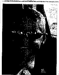
New Glasses - Just Like Papa's!