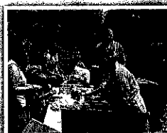
Cornerstone Baptist Church seniors providing lunch for missionary families & workers