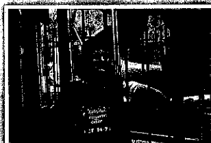
New Covenant Fellowship painting the fence and putting a shade cover over the playground