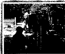
Cornerstone Baptist Church putting up new fences around missionary houses