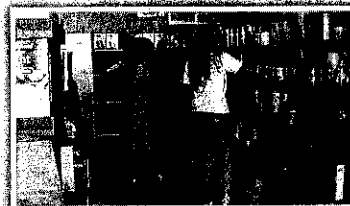
Brush Creek Baptist Church cleaning and sorting in Dad's Country Store