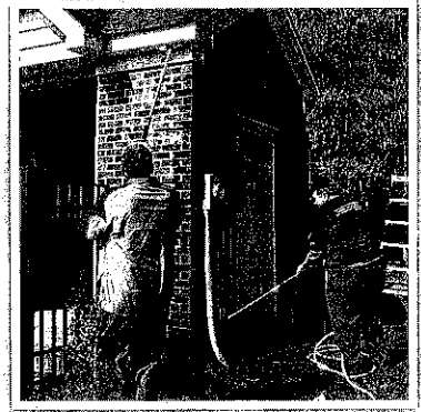
Pressure washing the guard house.