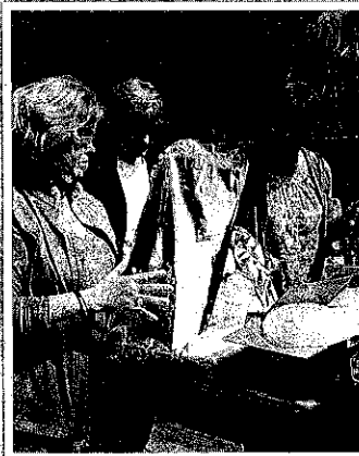
Fixing lunch for the work team and missionaries.