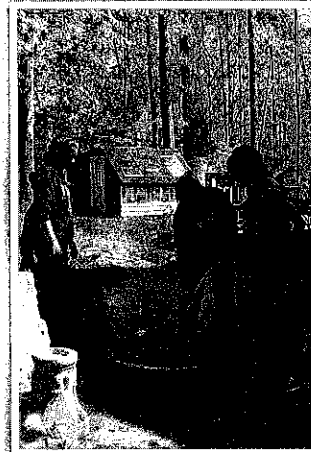
Working in Mother's Garden.