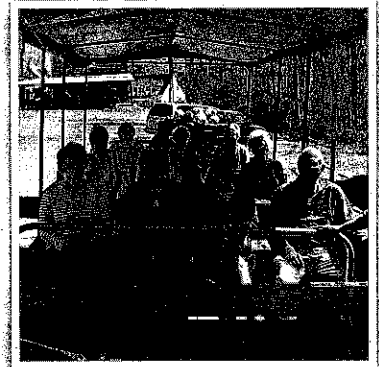
Senior Lunch and Tour: One of the senior groups who came out for lunch and a tour. Call for information of how your group can come out.