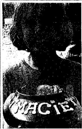
Playing with the missionary kids.