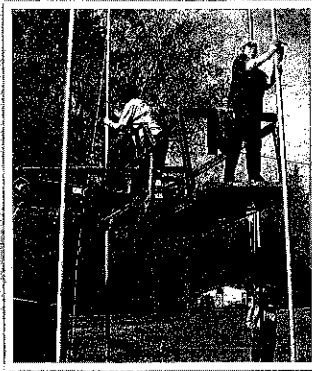
Painting the flagpoles.