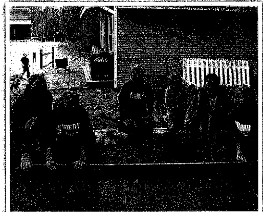
New Covenant Fellowship Church 318 Youth complete laying pavers in Mother's Garden.