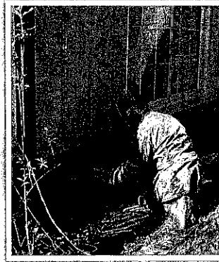
Working on one of our homes.