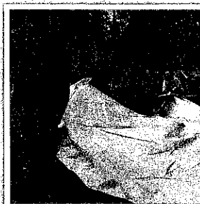
Laying the floor.