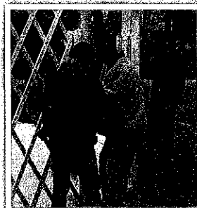
Putting up the walls.