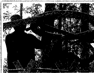
Putting up the roof trusses.