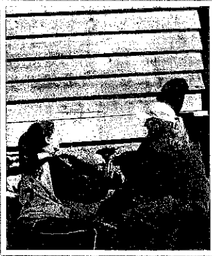
Wreck center foundation.

Rives Chapel Baptist Church came out on April 20th and did various projects around the SMH campus. These pictures show some of what was done that day, on Project InAsMuch.