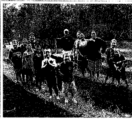
Missionary kids showing off the completed lasagna garden.