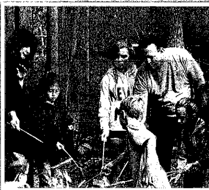
Families around the campfire during the Homeschooling Party.