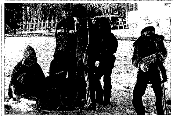
Missionary Kids sledding in the snow.