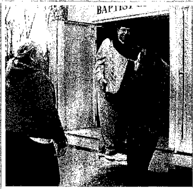
Mingo Baptist Church unloading donated clothing.