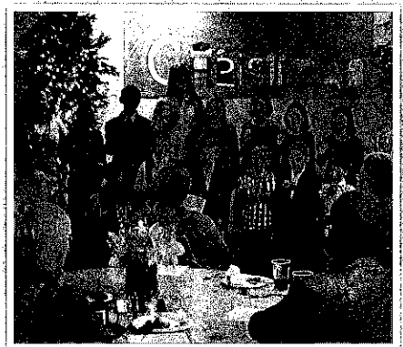
Missionary children played bells for Wake Chapel Church.