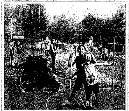
Missionary kids working hard on lasagna garden.