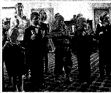
Missionary children played the bells during music recital.