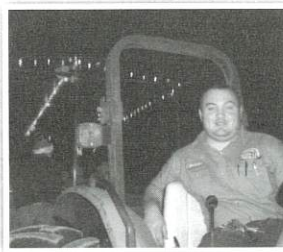
(left) Senior groups love to come to visit our campus for a tour and lunch. Call to find out how your group can come!