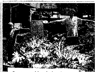
Preston and Jonah showing off garden last summer.