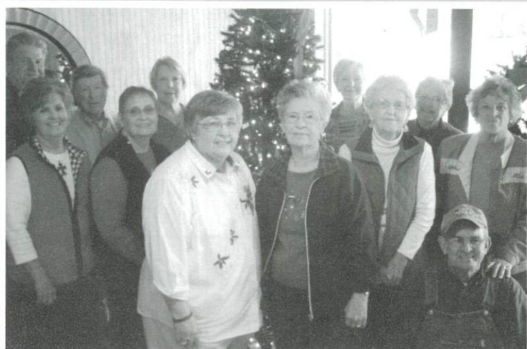
Mingo Baptist Church put up Christmas decorations in the Barber Shop.