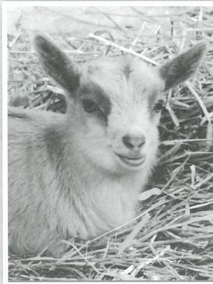
Gabby, our new baby goat, born on January 18th.

Jehovah's protection is amazing. So often, when difficult circumstances come our way, we tend to focus on the negative, the losses. We become so busy in our every day life, that we miss the promises of God. As I