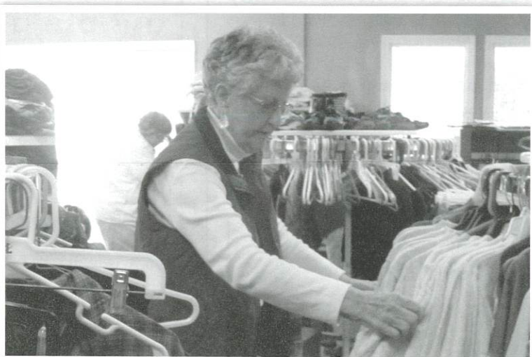
Mingo Baptist Church group came and sorted and hung clothing in the Treasure Chest.