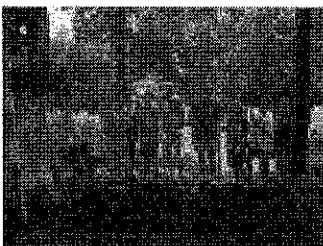
Graham Presbyterian Youth