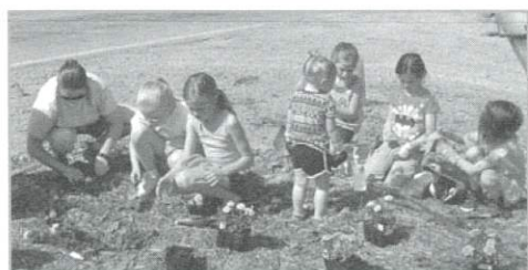
Homeschoolers from Greensboro, NC planted marigolds at the entrance. After their project was complete, they were able to go over to Camp Glory Farm and pet and feed the sheep.