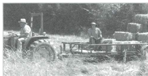
Henry & Ross baling hay. Larry on top of hay bales – 480 bales were collected!