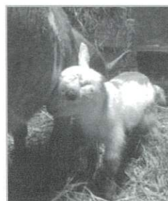
Our newest baby goat, "Boots".