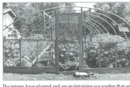
The interns have planted and are maintaining our garden that will provide fresh vegetables for our missionary families