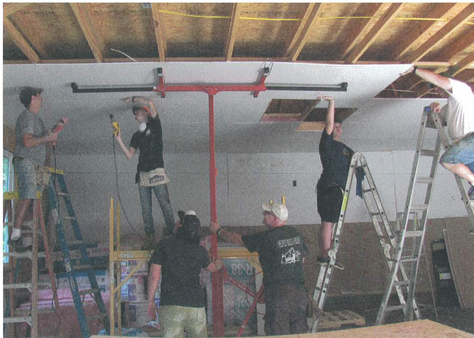
Osceola Baptist Church helped hang drywall in the Anniversary House garage ceiling.

We owe everything to God. He owes us nothing, yet He gives us what we need and blesses us "far more abundantly beyond all that we ask or think" (Ephesians 3:20). We should live giving Him thanks, acknowledging that our life and life eternal come from God the Creator and Christ Jesus, who as our substitute, paid the price of death for our sins. Complaining about what we have or don't have, is being unthankful. Giving thanks means living with an attitude of gratitude to our Heavenly Father.