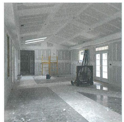
The inside of the Anniversary House – ready for paint and cabinets!