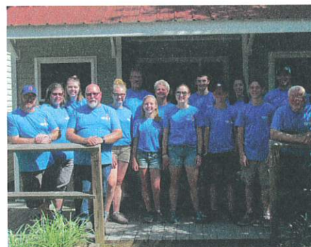
Maple Grove Church and Eden Worship Center came 4th of July week and installed insulation and drywall on the Anniversary House