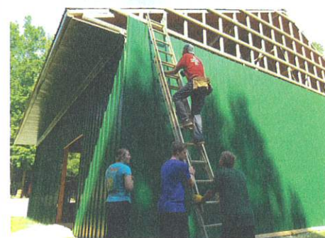
Wake Chapel hung all of the metal siding and soffits on our new Maintenance pole barn and helped move stuff from the Work Shop into the new pole barn.