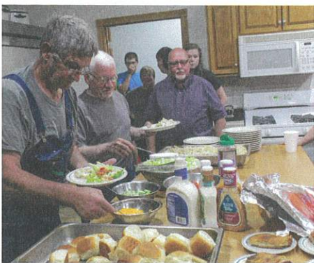
Mebane Presbyterian Church helped put up farm fence at Camp Glory Farm at Watson's.

see God bring people together from a variety of locations to unite as one team.