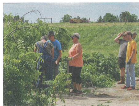
Maple Grove Church, Topeka, Indiana, came and helped with clearing fields, putting up farm fence, hanging drywall and insulation at Camp Glory Farm at Watson's.

Indiana were able to come, God provided an amazing group of local youth and single adult volunteers. Our team of 4 was multiplied many times like the loaves and fishes in great times of need.