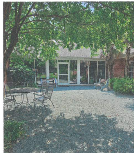
Before and after photos of the patio area behind the family center, which will help keep the weeds down and make a nice sitting area for the missionary families.