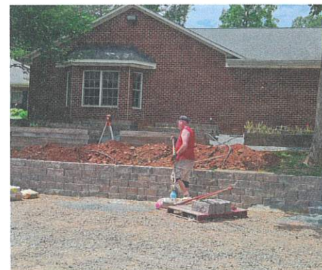
Digging the foundation for the new wall in front of the family center, which is also part of the garden area Kendric is creating for flowers and herbs. The wall is finished.