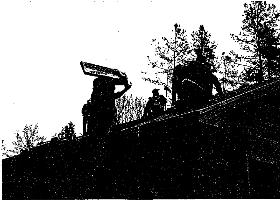
GROUP FROM APPLE'S CHAPEL, BETHEL BAPTIST & WESTSIDE CHAPEL SHINGLED THE ROOF