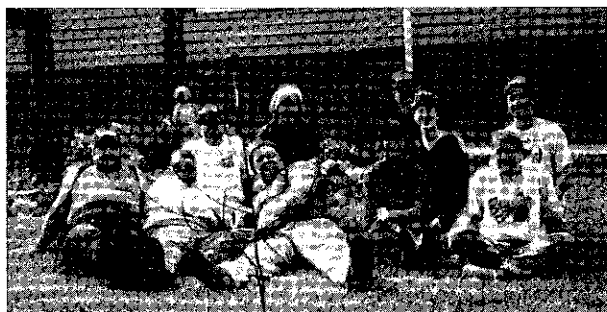
Maple Grove Bible Church also lent a hand.

Pray with us that the Holy Spirit will lay this burden of finishing this house on the hearts of men so that we can continue to renew our efforts to being that “link” in providing much needed housing for missionaries.