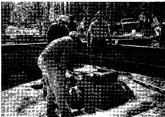
Men, women and youth from Hines Chapel Church in McLeansville, NC help out.

Back in July during our board of director's meeting, we decided to start building the director's house as the Lord provided. After the group from Trinity Baptist Church in Harriman, Tn. had fin-