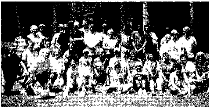
Trinity Baptist Church and Haw River Christian Church came out for a week of M.A.S.H. in August. They did various projects—dug footers for the Burden/Love Chapel, hung drywall, cleaned up a huge pile of logs, painted decks, built steps for the mobile home and did other yard work.