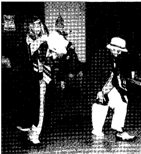
Trinity Baptist & Haw River Christian Church having game time.