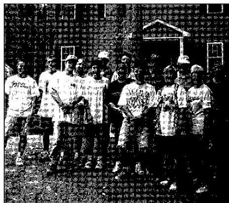
The Parable's Sunday School Class from Tabernacle Methodist Church, Greensboro, NC, came out several Saturdays to hang drywall in the director's home.