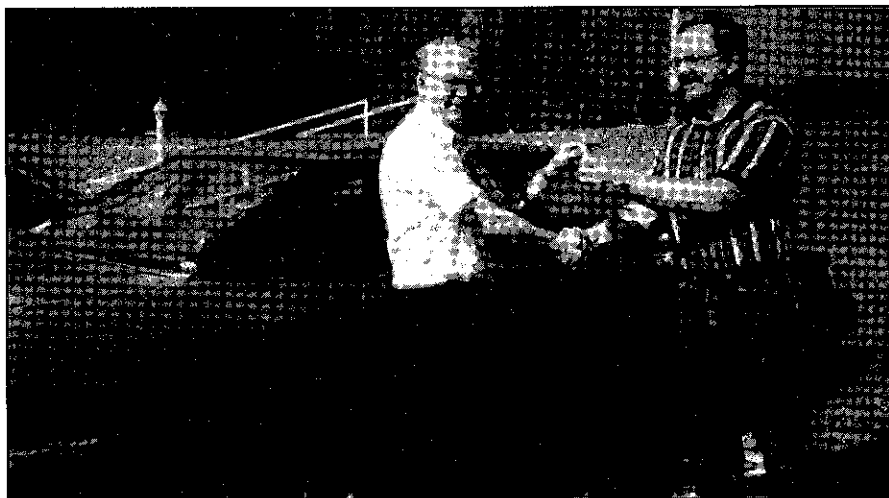
Receiving the key from the treasurer at Riverside Baptist Church.

Thank you again, Riverside Baptist Church. We think of you every time we start the car!!!