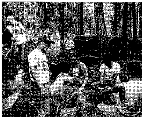
Factoryville Christian School did some landscaping in a new flower garden.