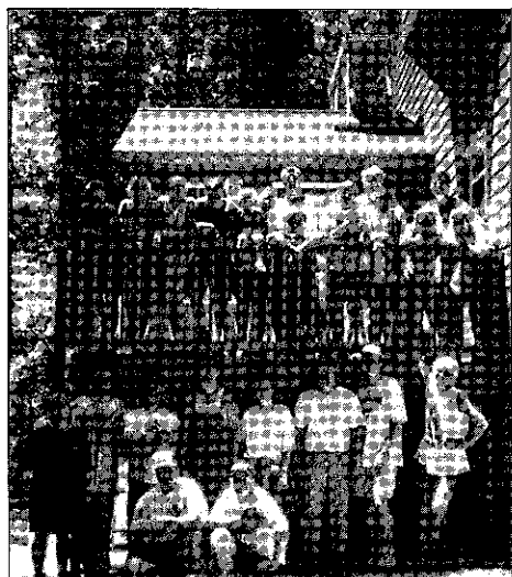
Three Rivers Bible Church and Faith Baptist Church both out of Michigan, as a group on the deck that Three Rivers built.