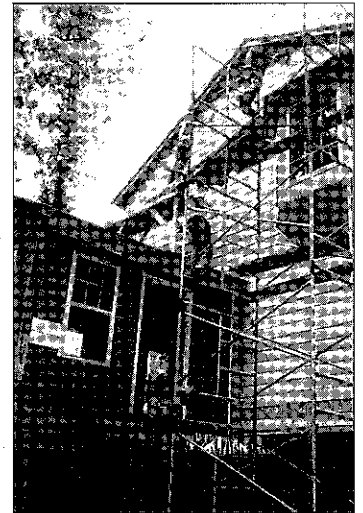
Men from Mottville Bible Church, Mottville, Michigan, came and finished the siding and the bay window on the house.