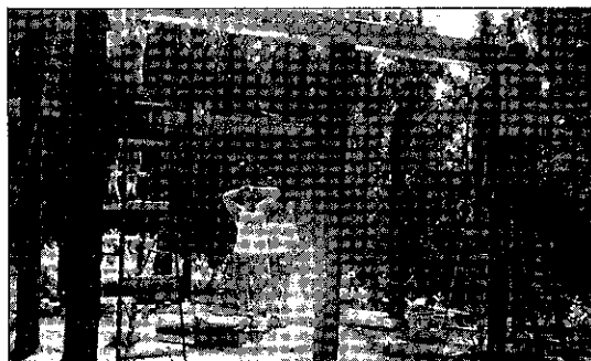
Faith Baptist Church began construction of a much needed tractor shed.