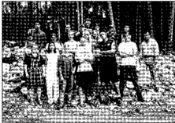
Factoryville Christian School, Athens, Mi. worked to clear out brush and build the stage for the pig pickn'