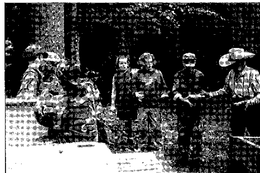
Riverside Baptist Jr. High teens, Grabam, NC, picked up brick from an old farm to be used as sidewalks around the SMH property. They also spread mulch in existing gardens around the duplex.