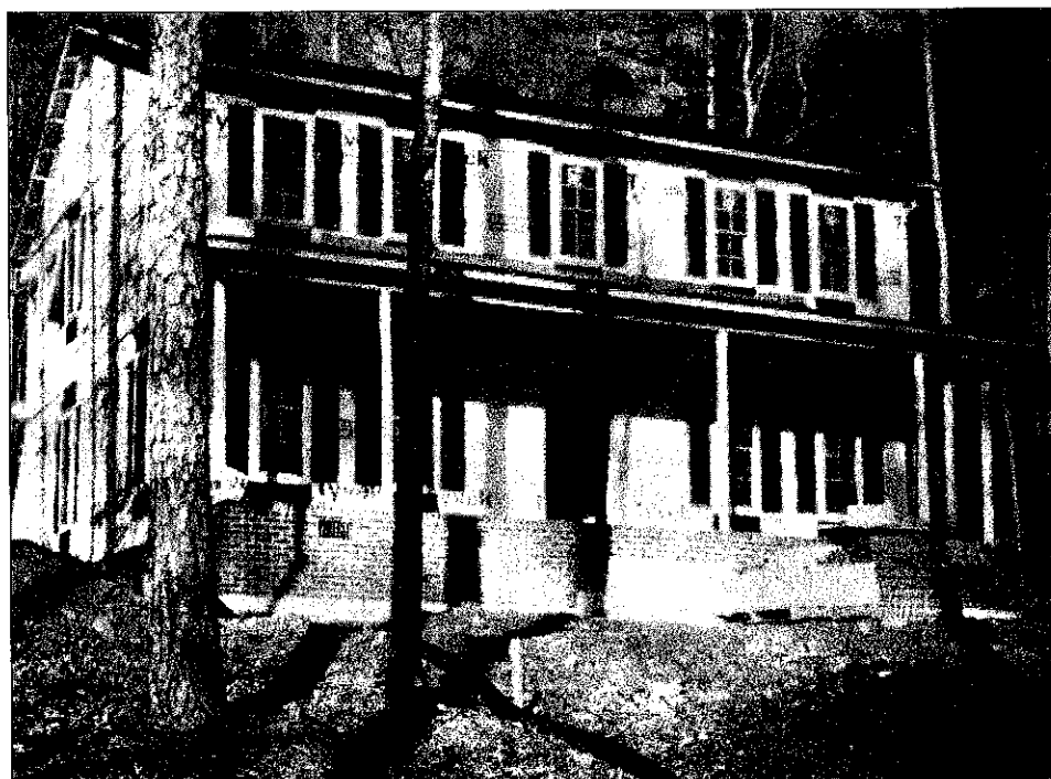
The Isley House will be a wonderful place for college age MK's.

In the last newsletter, I mentioned that this home would be used as a starter home for college age MK's. We have had several inquiries from MK's already. Please pray with us about this much needed home. If you would like to help, please give us a call.