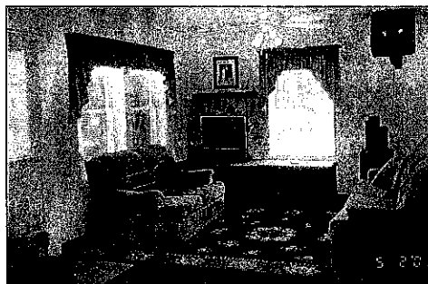
Stanton Hall, our new fellowship building is a wonderful addition to our facilities.