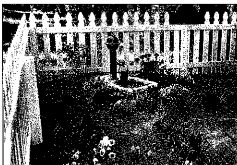
Mother's Garden was dedicated in loving memory of Betty Barber, and in honor of all moms.

We praise the Lord for these two new additions to our facilities here at Siloam, and for each one who made our day of celebration possible.