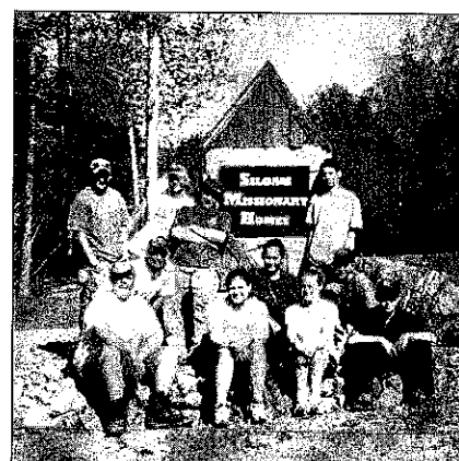
Altamahaw Baptist Church teens spread 4 truckloads of mulch! Thanks everyone!

Welcome to project corner. We praise the Lord for all of the help that we have had over the past two months. We have had help from people in Virginia and Tennessee. And we don't want to forget all the help we have had from people here in North Carolina!