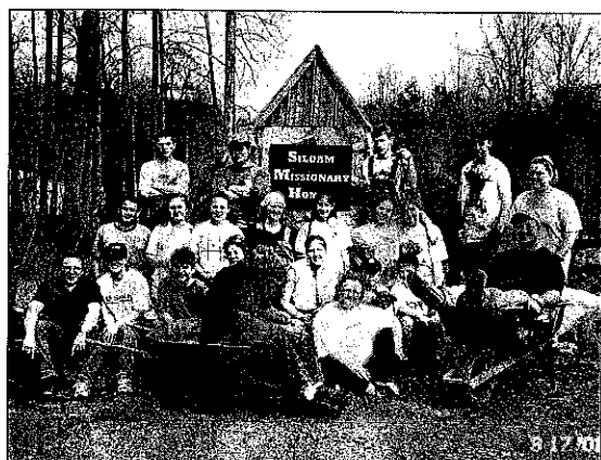
Agape Baptist Church and Greenway Park Baptist Church youth worked hard, but also had a time of fun and fellowship.

"Love isn't just a feeling in your heart, it is work gloves in your hand"