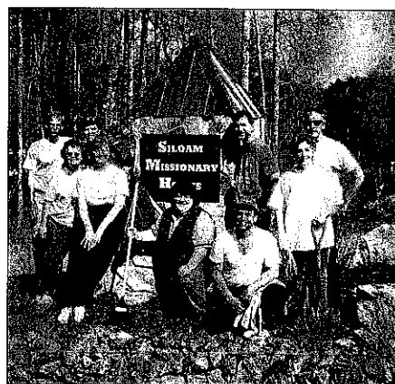
Outlook SS Class did a great job spreading mulch.