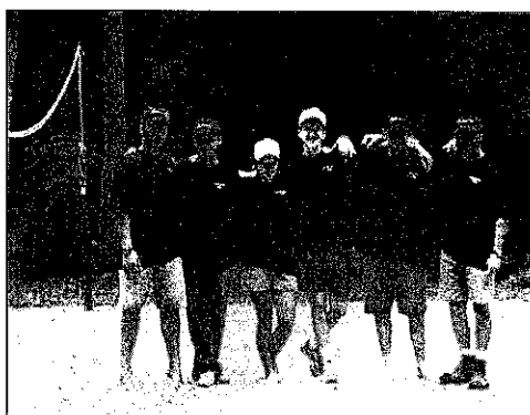
The group pauses proudly for a moment inside the volleyball court after all their hard work to smooth out the sand and put timbers around the exterior of the court. Fantastic.

I think of the scripture verse in James 1:22 "But be ye doers of the word and not hearers only." Each of you not only worked hard but you were an encouragement to us to continue to keep going. The missionary families enjoyed meeting you and for years to come the children here will enjoy the fruit of your labor.