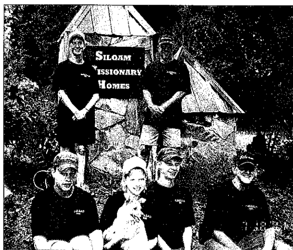
Our third group, Maple Grove Bible Church of South Haven, Michigan.