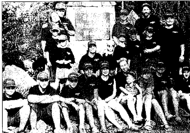
Our second group, 1st Baptist Church of Stockbridge, Michigan.

The next group to arrive was the caravan from First Baptist Church of Stockbridge, Michigan. It looked like one of those old VW