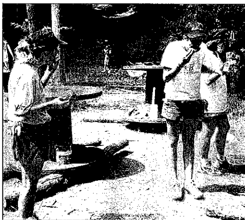
Nothing tastes better than a cold watermelon when you've been out working at SMH in the hot sun!