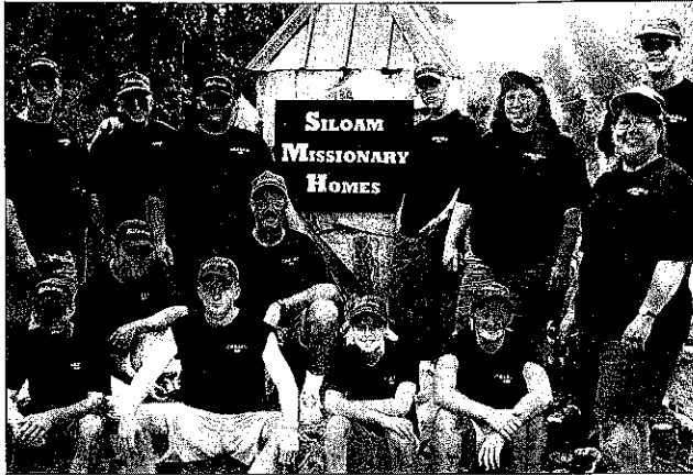
Our first work group, Maple Grove Church of Topeka, Indiana.

It's hard to know where to start. We have had so many wonderful helpers this summer doing various projects, I'm afraid I'll leave someone out. It all started with Agape Baptist in Mebane, NC who put in the volleyball court back in the spring.