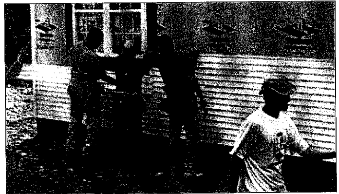
BETHEL BAPTIST CHURCH came out and spent a Saturday putting siding on the MK home addition.