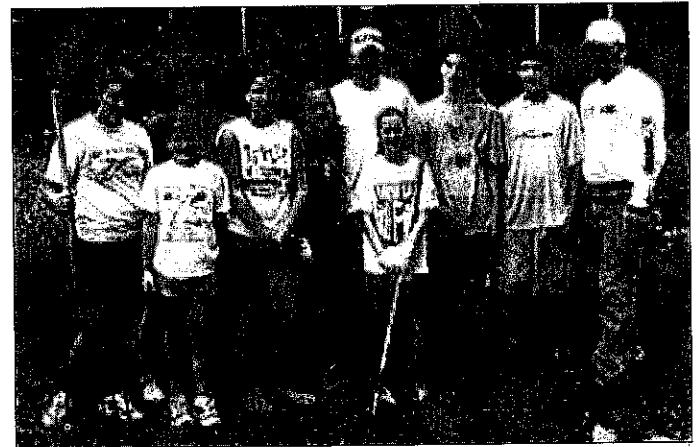
ALTAMAHAW BAPTIST CHURCH young people and adults came out and put fresh mulch at the mission property entrance way.