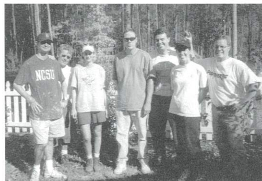
A Sunday School Class from Westover Church had a great time of fellowship while painting the fence and deck rail on one of the houses.