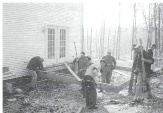
A group of men from Bethel Baptist Church gave a Saturday in November to build the deck on the back of the MK home. A great place to relax!