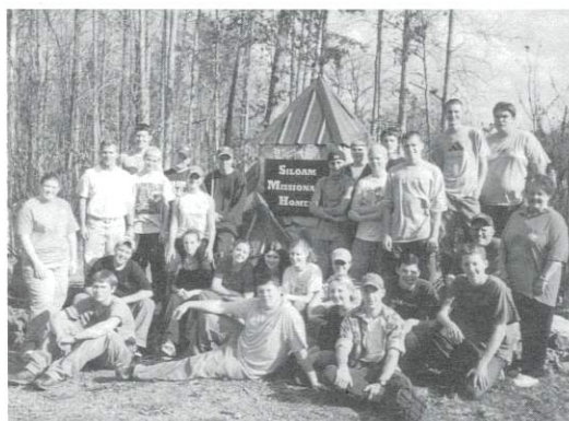
The 10th grade class of Alamance Christian School came out and raked leaves and did a lot of odd jobs. Thanks gang!