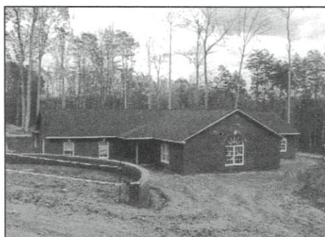
top left: Shingles put on by Hines Chapel, Apple's Chapel and Osceola Baptist men, October 11, 2003