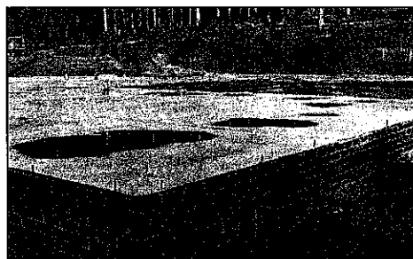
Slab completed September 16, 2003