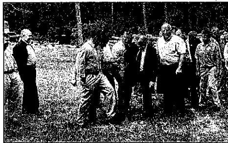
Groundbreaking for the Family Center May 4, 2003

To date, we have commitments of $123,000.00 towards the goal of $300,000.00. Like King David said to Goliath, "I come in the name of the Lord!" Pray for us here as we complete the task before us.