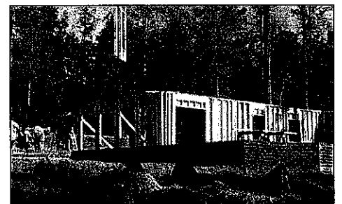
Interior and exterior walls put in place October 1, 2003"