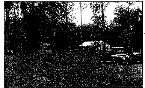
Bulldozing begins August 4, 2003