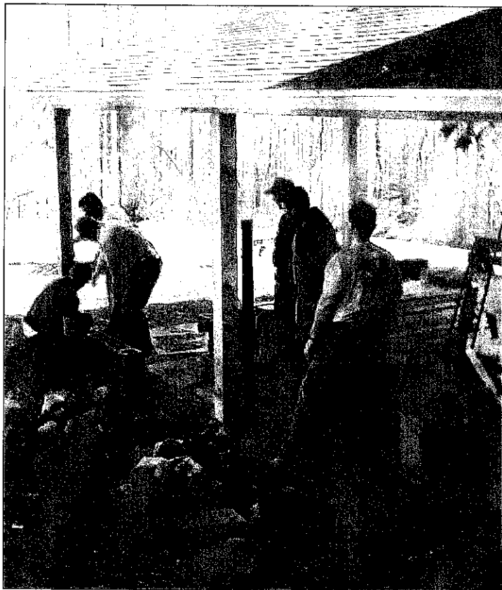
A group of men from Osceola Baptist Church came out and helped lay some block.