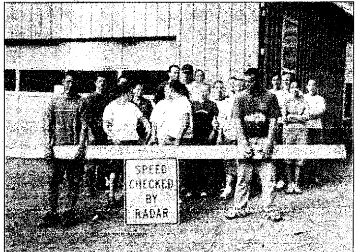
Roselawn Mennonite Church standing in front of their project - the enclosed tractor shed.