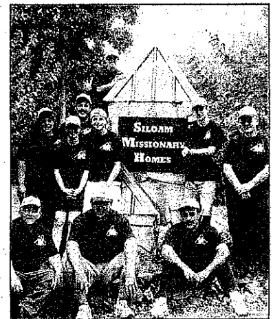
Maple Grove Church worked through the rain and heat to finish enclosing the workshop, making the property look neater!

We have enjoyed spending time with old friends and making new ones this summer. It is so awesome to serve God along with such willing groups of people. God is good!