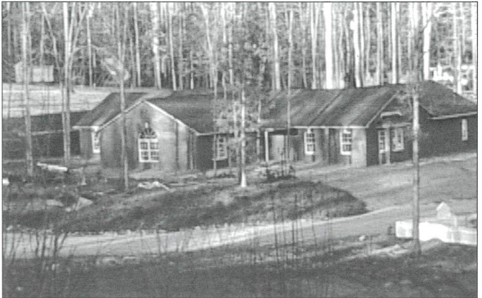
The Family Center is going to be a blessing to all of us at Siloam Missionary Homes.

Please pray for safety and all the work being done here at Siloam Missionary Homes.