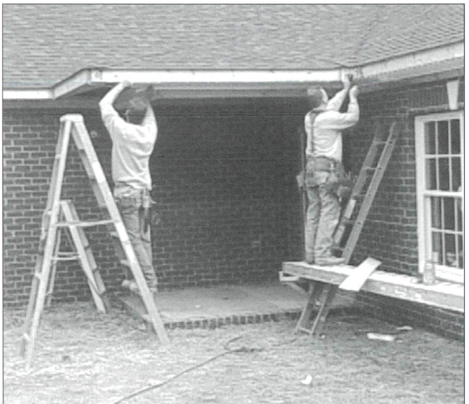
IT'S LOOKIN' GOOD!"