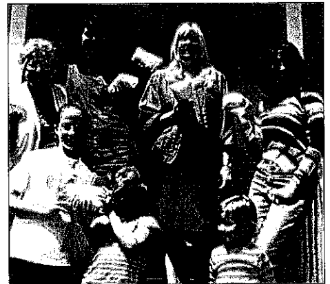
Some of our missionaries hold up a package of ground beef and say "thank you" to Roselawn Mennonite Church for their generosity.

Thanks to everyone who has given various items to make Siloam Missionary Homes a nice place for all of the missionary families.