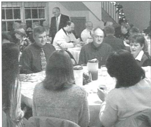
December started with a delicious meal and great time of fellowship for the missionaries, board of directors and other guests.

How we thank the Lord for all of you sharing with us for our special Christmas project. The outpouring of God's people made it possible for us to provide a wonderful dinner for the adults and guests, and a pizza party and gifts for the missionary children. We also praise the Lord for providing an air hockey table, a new computer and ending the year in the black. Praise the Lord! Thank you for being a part of a Christmas we will remember.