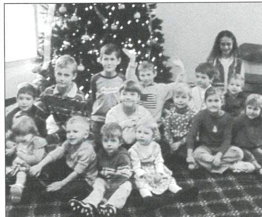
Missionary kids gather around the Christmas tree before opening presents at their party.