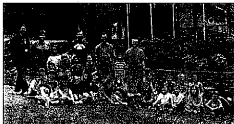
Haw River Christian Church Sparks and leaders spent a day building a new landscaping wall and then planting beautiful flowers at our entrance way