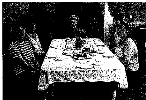
During one of our Thursday ladies' Bible studies, we were treated to an authentic "English Tea" by two of our missionary ladies