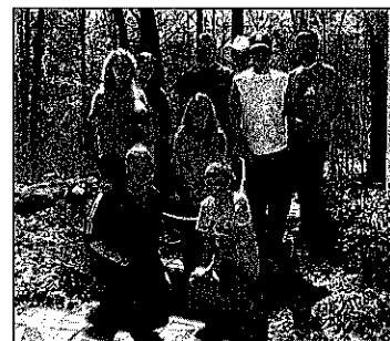
Bethel Baptist Church teens weeded and put new mulch in the flower garden around the Burden Love Chapel