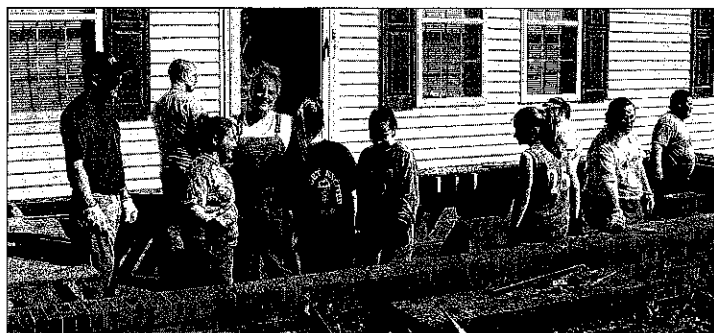
Edgewood Baptist Church teens spent a Saturday tearing out an old front porch floor and getting it ready for a new concrete floor