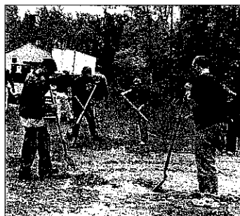
Osceola Baptist Church teens came out and dug and poured footers to get ready for "Dad's Country Store"