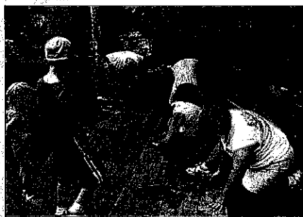
Putting brick pavers in place for the new sidewalk to the Prayer Rock.