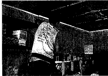
Hanging the ceiling.