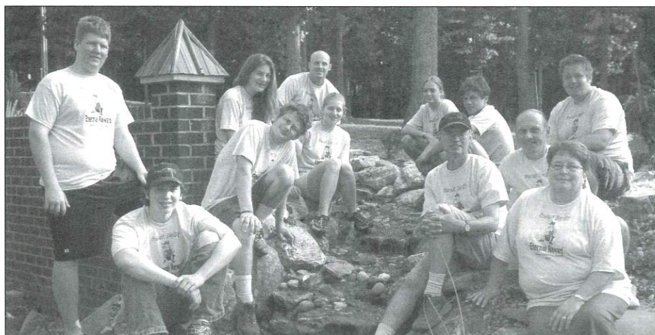
Bible Baptist Church group photo.

The group took turns washing, scraping and painting the fence.