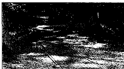
Completed sidewalk to the Prayer Rock.