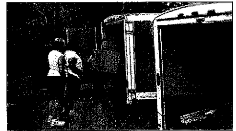
Unloading the boxes of food donated by the church.