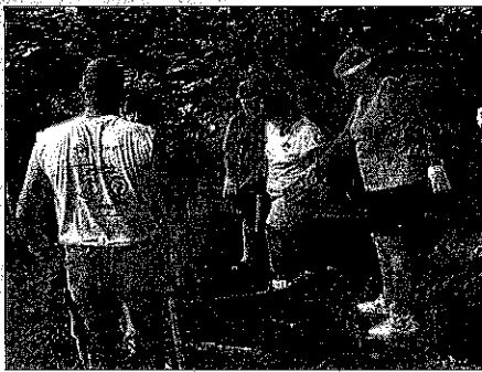
The Prayer Rock path before.