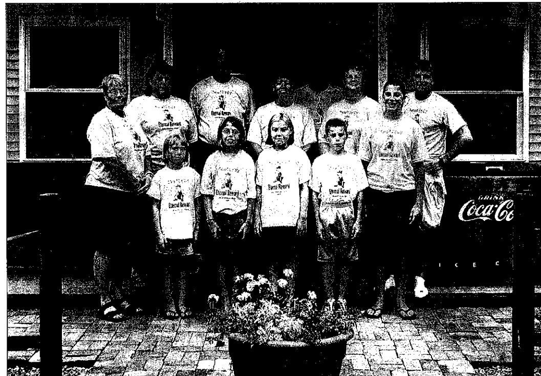
Maple Grove Church group photo.