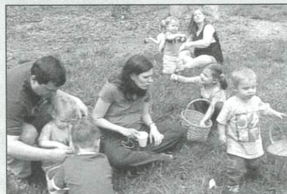
The kids enjoy the easter eggs they found during the hunt.

Right now, we have 26 missionary kids and 1 “on the way” at Siloam! It is wonderful to to see so many kids playing out here, knowing that we are possibly raising the next generation of missionaries!