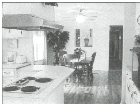
Completed dining room addition.