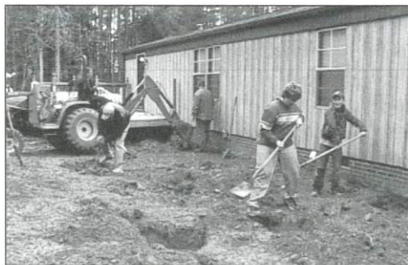
Osceola Baptist Church prepare foundation.

Praise the Lord for His marvelous provision!