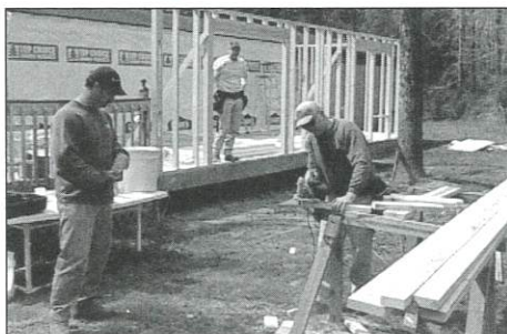
Holly Hill Baptist Church frame up floor and walls.