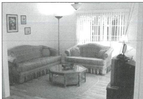
Completed living room addition.