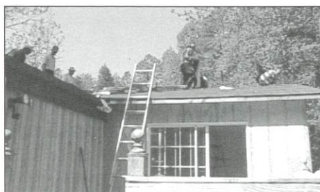
Apple's Chapel put on shingles.