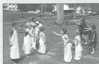
Children carefully tossing eggs.