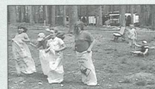
MK's and Pleasant Hill homeschoolers enjoying a sack race.