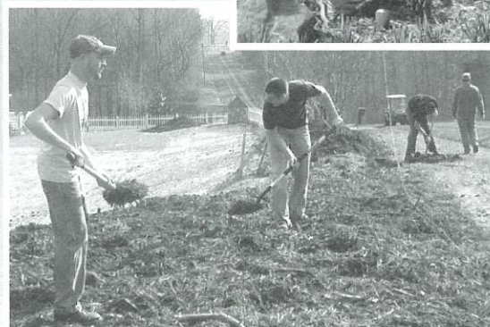
Shown at left, members of the Mars Hill Baptist Church digging in.