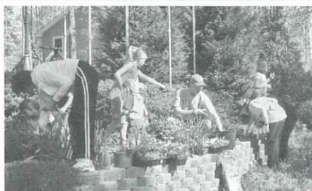
Edgewood Baptist Church (above) brought flowers to plant around the flags at the entrance way.