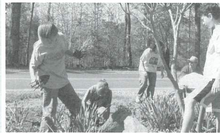
Shown above are the youth from Christian Bible Fellowship, gave up a Saturday in April to come out and plant flowers at the entrance.