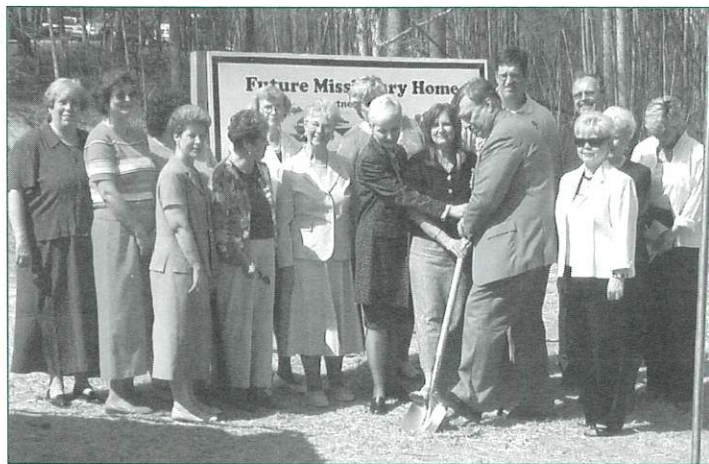
Mt. Zion Association Leadership Team breaking ground.