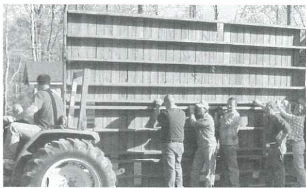
Haw River Christian volunteers (above) helped move a couple of deck platforms into place.