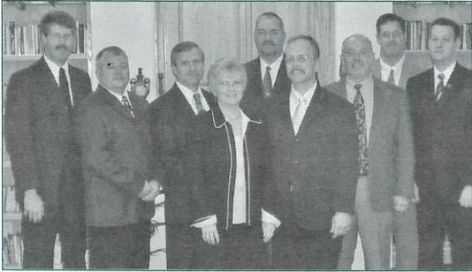
Board of Directors for 2006 (new board members not shown)