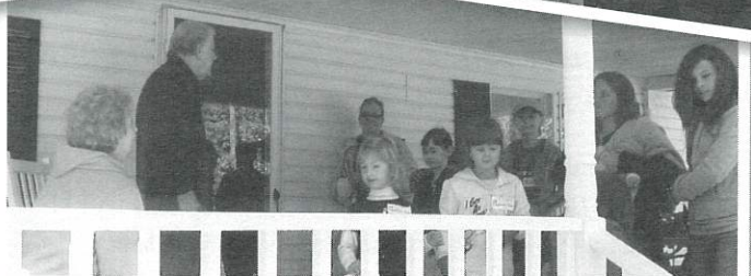
Clockwise from left: MK's & Homeschoolers on trolley ride; Pumpkin decorating contest; Visit to SMH chickens; Kids and parents visited missionaries at Siloam, to hear about their ministries.