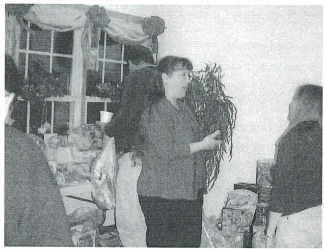
The missionaries enjoy getting together and sharing their lives, their ministry and their burdens.