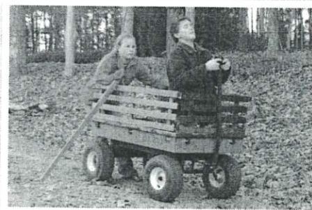
Two of our MK's make their own fun with a wagon and a hill.