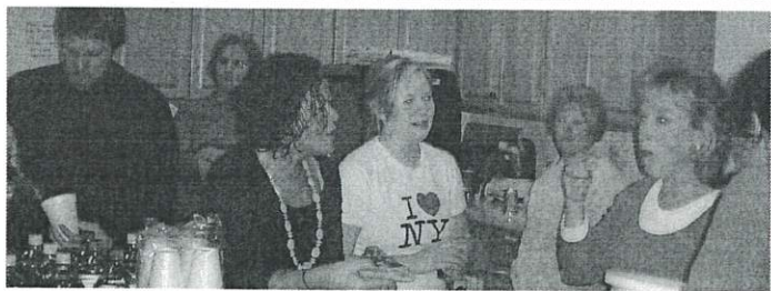
Youth Groups from Harvest Baptist, New Covenant Fellowship and Riverside Baptist joined together for a Super Bowl party at Siloam. Some of the missionary families joined in with the fun, food, fellowship, a "half time" of praise and worship, and a challenge from one of the youth pastors.