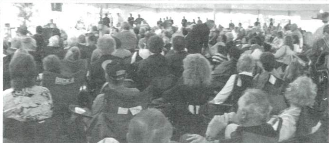
In spite of the drizzle, we had a great crowd.