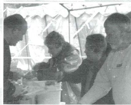
BBQ, beans and slaw, tea and dessert is always a big part of a great evening.